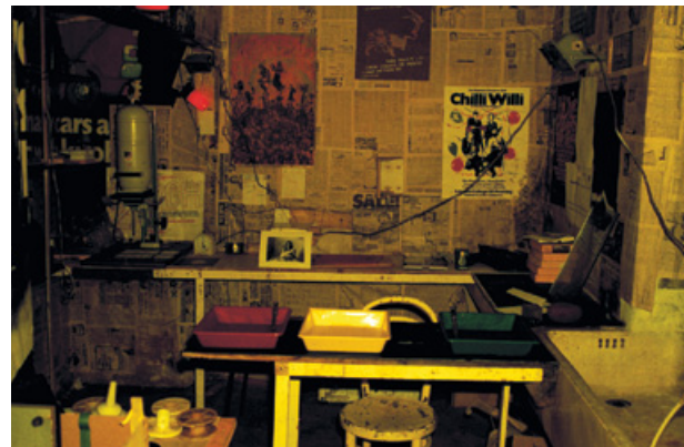
P6 [from top]: 81 Thicket Road Kitchen, Xmas Day 1976 Interior, Keith's room, 81 Thicket Road, December 1976 Basement darkroom, 81 Thicket Road, December 1976 P7: Jimmy and stairwell, 79 Thicket Road, December 1976